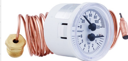
040702.. Back Connection